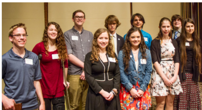
2016's high school nominees

What would the New River Valley community do without volunteers? Since 2009, we have listened to stories at our annual banquet, where we are consistently reminded of the enormous impact people of all ages are making on their community through service.