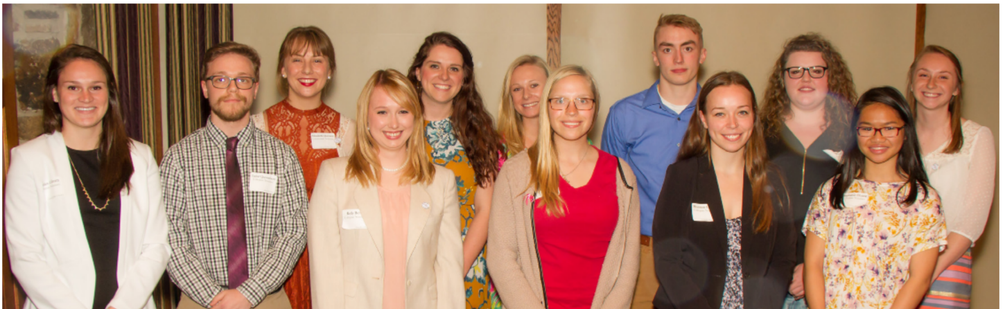
2016 collegiate nominees